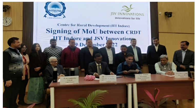
MOU Signing with JSV at IIT Indore