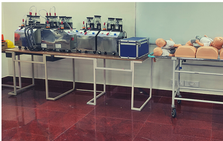
Well-equipped Laboratory 1