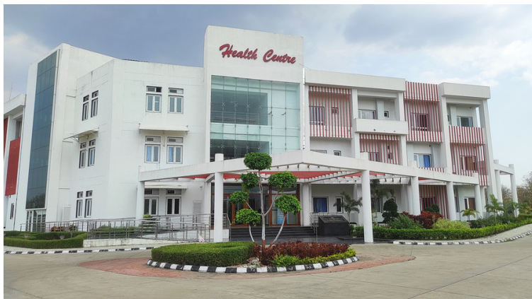
Health Centre, IIT Indore